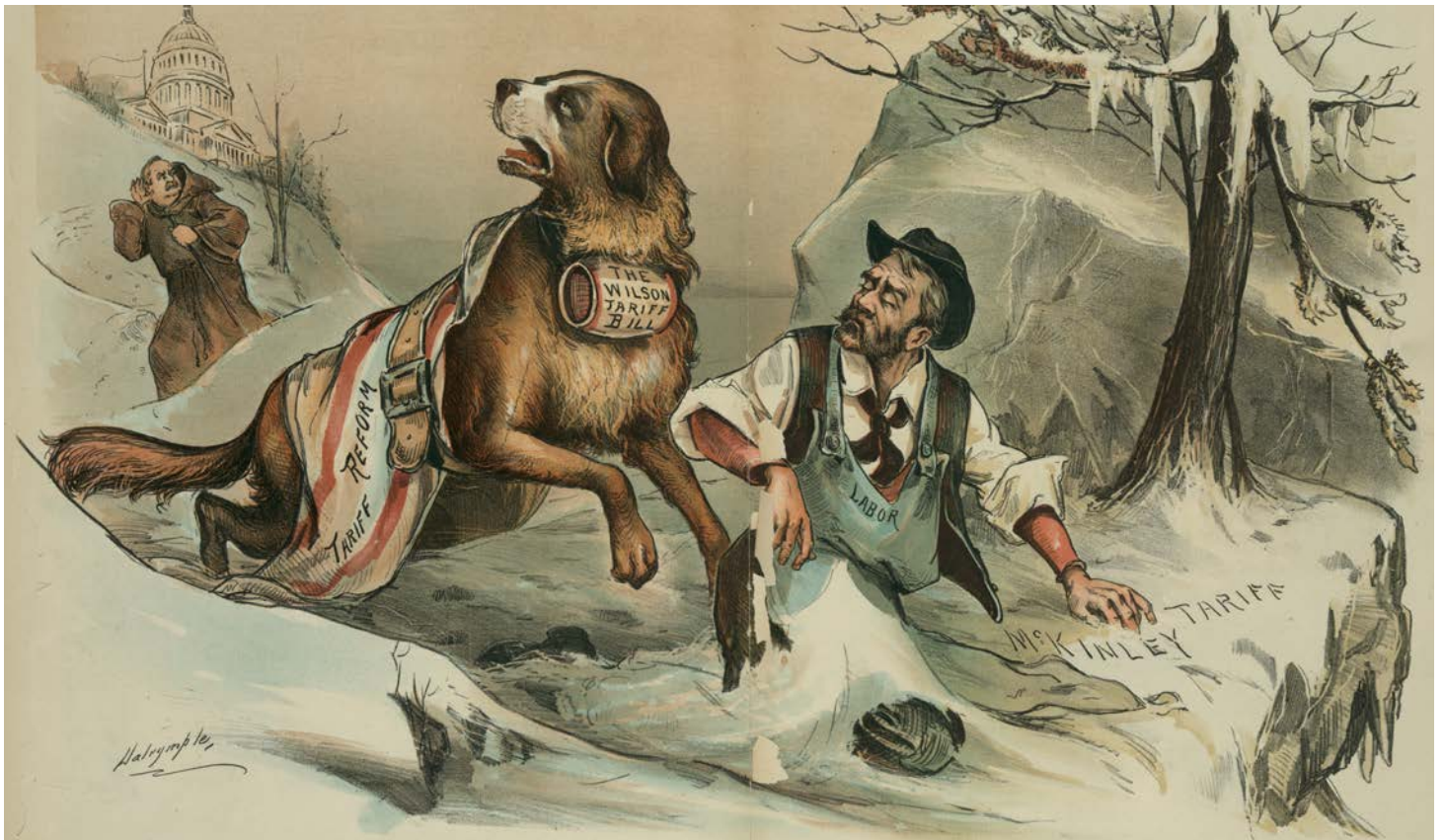
1894 print shows a St. Bernard rescue dog with a blanket labeled “Tariff Reform” strapped to its back and a small barrel labeled “The Wilson Tariff Bill” under its chin, next to a man labeled “Labor” caught in snow drifts labeled “McKinley Tariff”; nearby, Grover Cleveland, as a monk with a hand to his ear, responds to the dog’s bark. At the top of a hill, in the background, is the US Capitol.